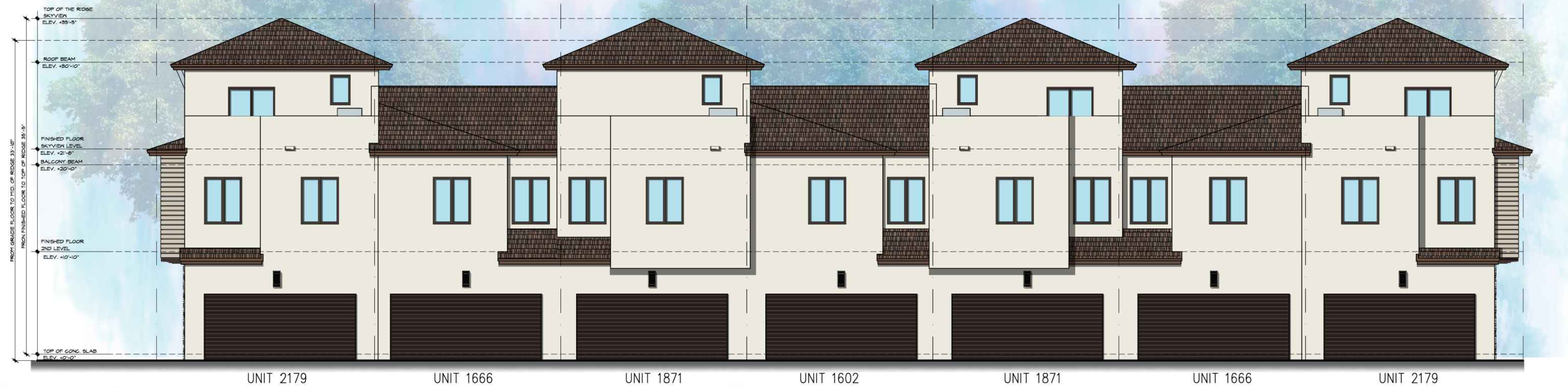
7 UNIT BUILDING LINEAR - REAR SIDE ELEVATION SCALE: 1/8" = 1'-0"