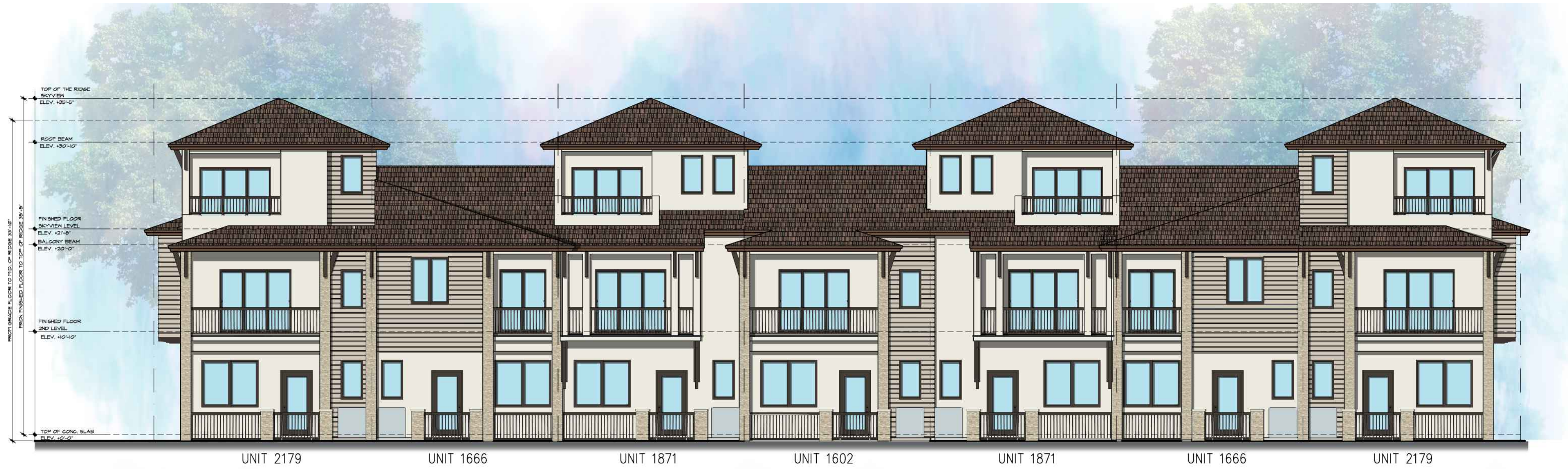
7 UNIT BUILDING LINEAR - FRONT ELEVATION SCALE: 1/8" = 1'-0"

Received after DRC Meeting to address DRC comments prior to the submission of a Building Permit Application.